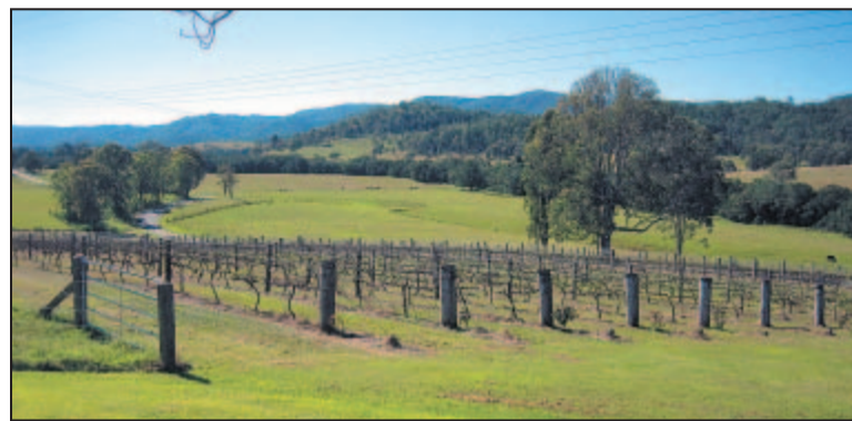
GRAPE EXPECTATIONS: Winya Wines features 1.2ha of vineyard.

The tourism association plans to relaunch its website – www.somersettourism.com.au – on July 6, but more information on local attractions is available on the site now.